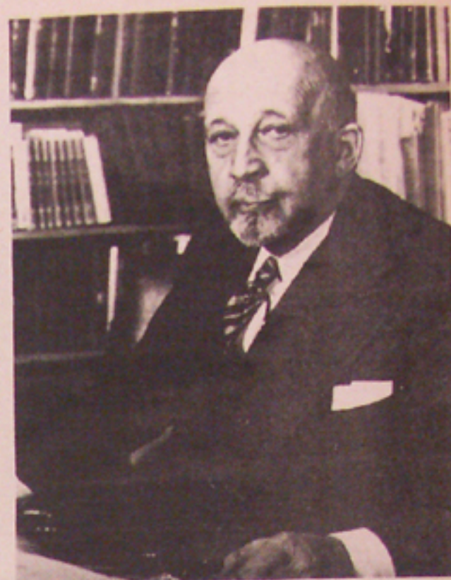
Dr. W.E.B. DuBOIS displayed forthright courage in both the literary and social worlds.