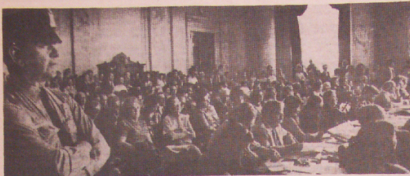
The televised Watergate public hearings (above) can lead us astray. Power, raw control was Operation Gemstone's goal.