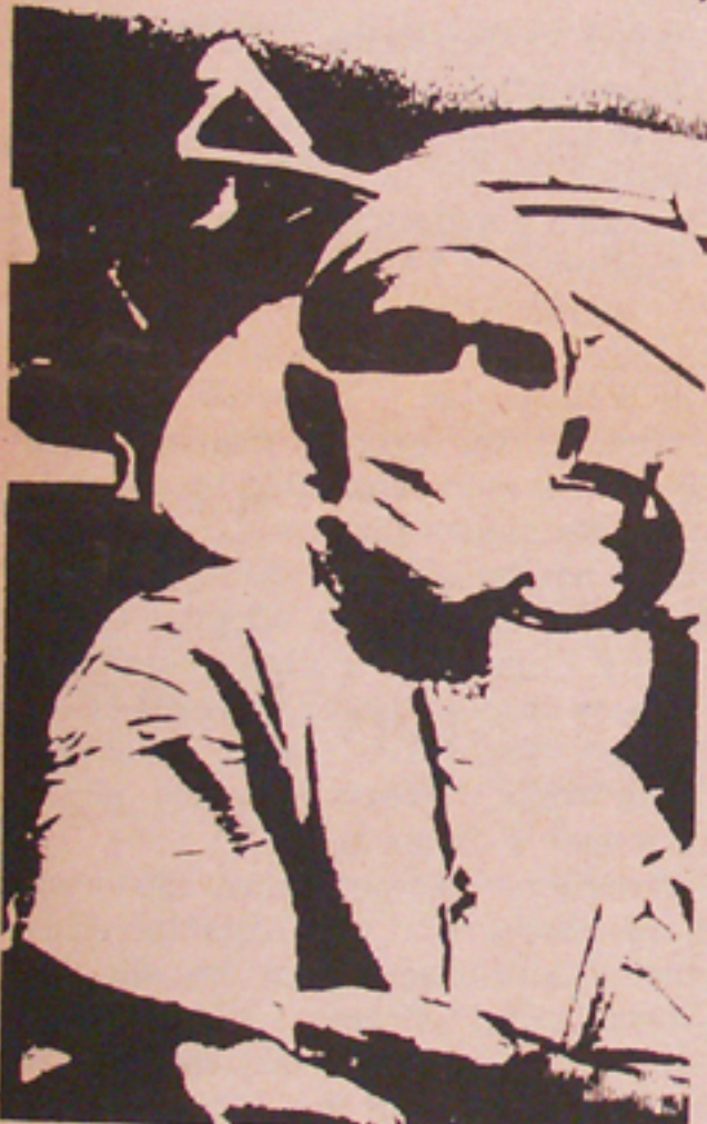
Psychosurgery to control "violence" is a macabre and vicious form of people-control.