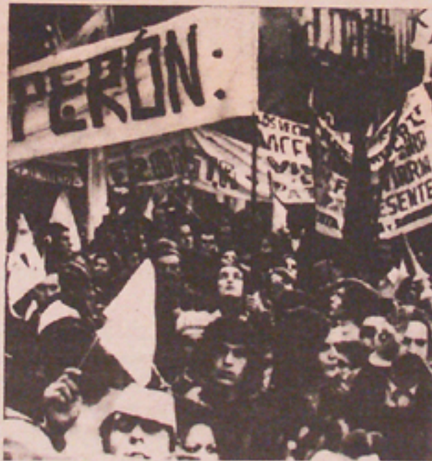
500,000 jubilant Argentines jammed the streets for the inauguration of their newly elected president.