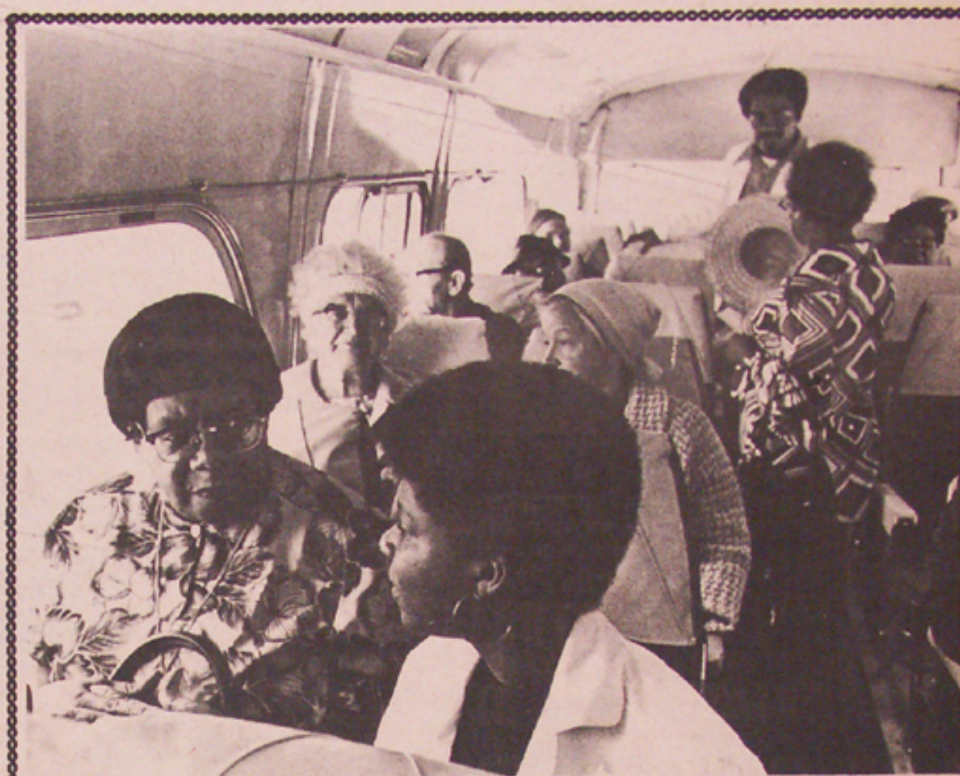
SENIORS AGAINST A FEARFUL ENVOIRMENT (S.A.F.E.) PROGRAM

Provides free job-finding services to poor and oppressed people who cannot find work.