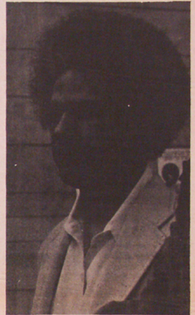
In the epilogue of his latest book, REVOLUTIONARY SUICIDE , HUEY P. NEWTON eloquently reveals who the victors will be in the struggles ahead.

There is another illuminating story of the wise man and the fool, found in Mao's Little Red Book: A foolish old man went to North Mountain and began to dig; a wise old man passed by and said, "Why do you dig, foolish old man? Do you not know that you cannot move the mountain with a little shovel?" But the foolish old man answered resolutely, "While the mountain cannot get any higher, it will get lower with each shovelful."